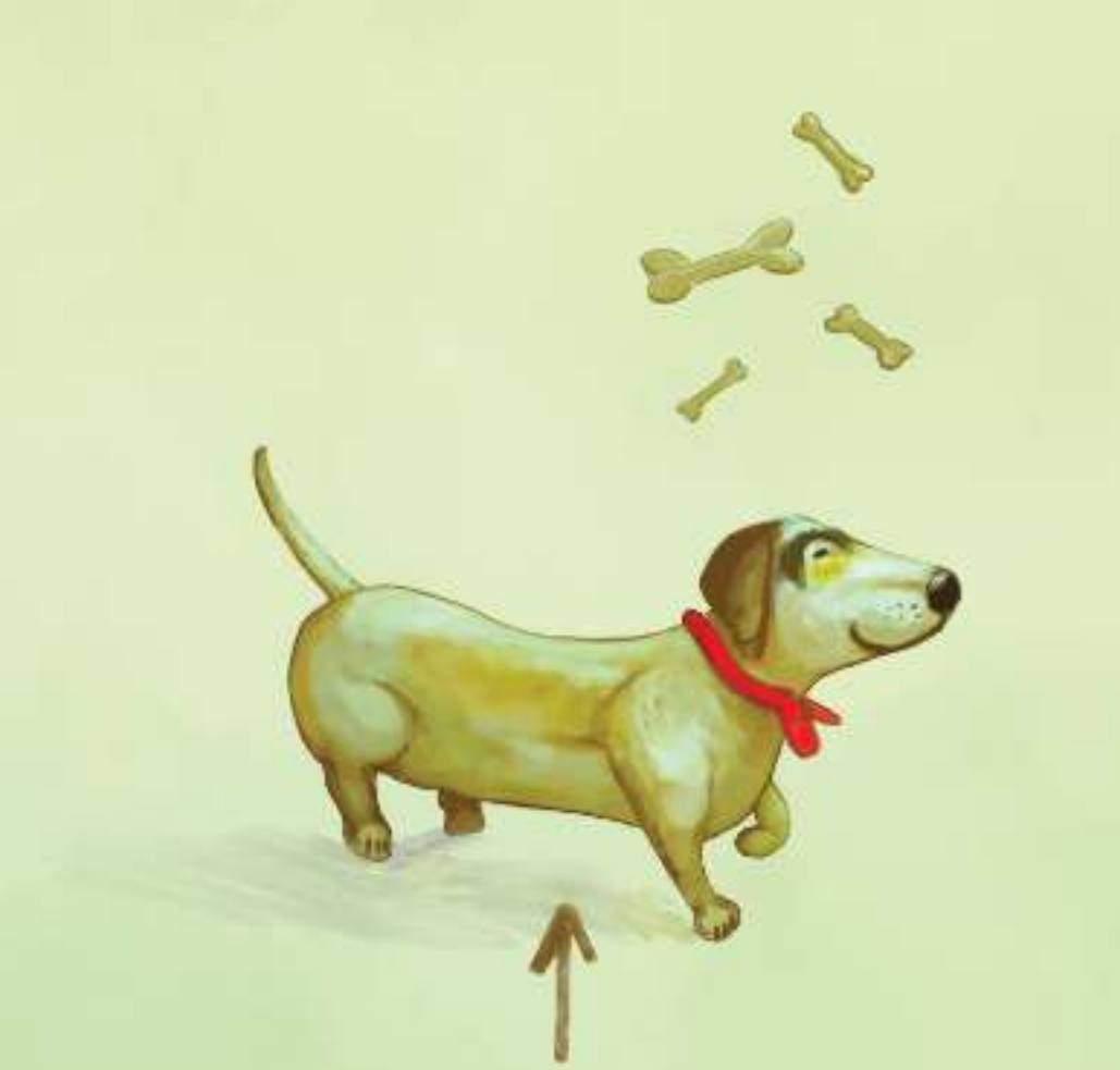
Spud ( Sir Spuddle Buttlington )

The house had lots of nooks to explore, and of course, they loved to spoil her. Her grandparents always had special treats hidden around the house.