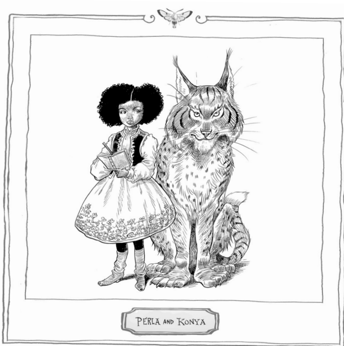
PERLA AND KONYA