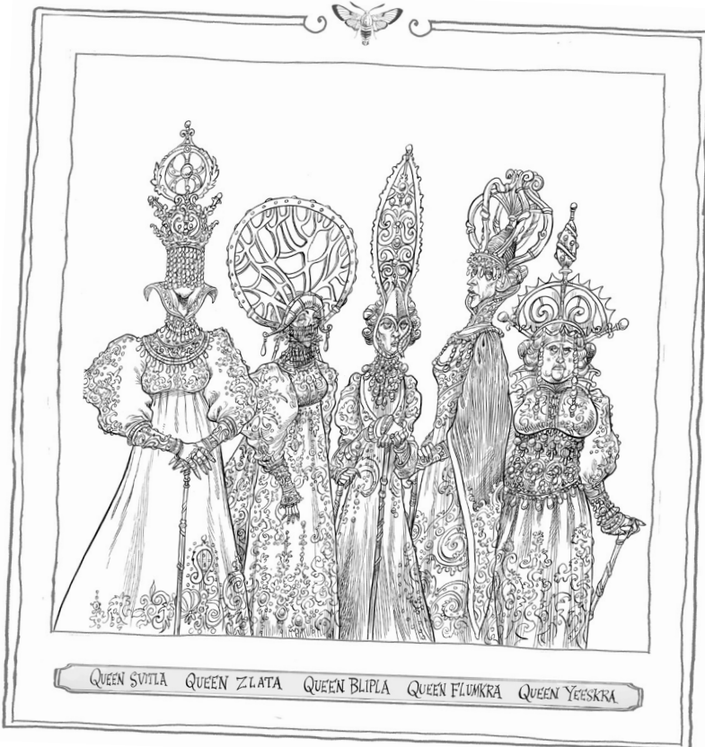
QUEEN SVITLA QUEEN ZLATA QUEEN BLIPLA QUEEN FLUMKRA QUEEN YEESKRA