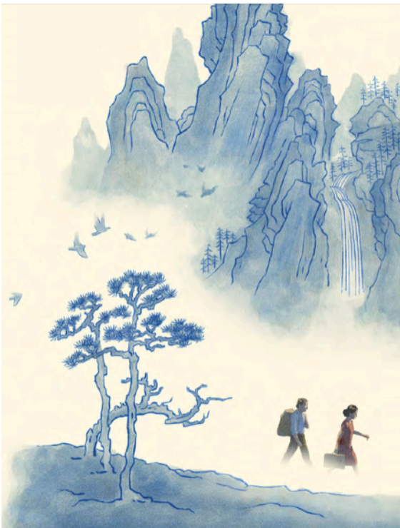
Illustration from My Strange Shrinking Parents by Zeno Sworder