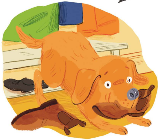
At home ...