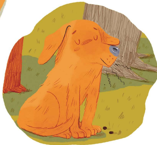
in the dog park ...